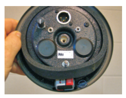
Move foam to access battery.