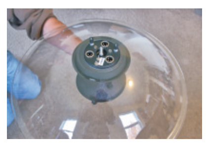
Place dish over mic unit.

To assemble the parabolic microphone, insert the Microphone Unit into the dish center hole. This works best if you place the dish over the Microphone Unit with the microphone connectors pointed up. Put the power switch in the center position. Now, place the Handle onto the threaded stud of the Microphone Unit. Rotate the handle to align the connectors with the opening. Slightly squeeze the assembly to keep it together, and rotate the four star hand knob clockwise three turns. Make sure the connectors are still aligned with the holes in the back panel, then rotate the hand knob until you feel a hard stop, but don't over tighten. When tightened correctly, the dish will be able to slightly rotate, by hand, but hold it's position on it's own. The dish is mounted with a foam suspension system to reduce handling noise. If over tightened, this feature will no longer function well. Finally, put the switch in it's normal position, power off is down. Disassembly is the opposite of assembly. To install and uninstall the stereo separator plate, if you have the Mono-Stereo model: Place the separator plate on the Microphone Unit's front facing booster plate, between the dual foam windscreens, and secure finger-tight with the 8-32 plastic thumbscrews. Note, if you have the Secondary Windscreen accessory, you can keep it on at all times when assembling and disassembling the microphone.