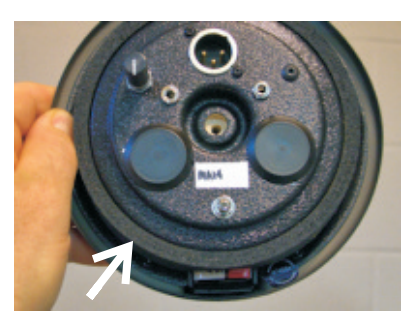
Foam cover over battery.

opening. Lift the foam collar to uncover the battery holder. Install the battery by placing the battery into the battery holder, with (+) being on the right side when viewing from the connector side, with the battery at the bottom (see label). Slide the battery into the holder, keep pushing the battery towards the center of the microphone unit until the battery snaps into place, and the battery is flat in the holder. To remove the battery, grab the end of the battery and pull up or pry up with a pen or small screwdriver to dislodge the battery from the battery snap mount. Once dislodged, it will easily pull out with your fingers. When you are finished with installing or removing the battery, be sure to place the foam collar back into place.