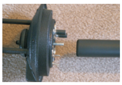
Showing how the Mic Unit stud can be threaded into the Handle Base.

The Secondary Windscreen can stay on the Mic Unit while assembling and disassembling.