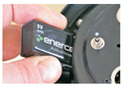
Insert battery into holder.