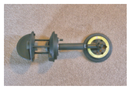
You can assemble the Mic Unit onto the Handle for storage.