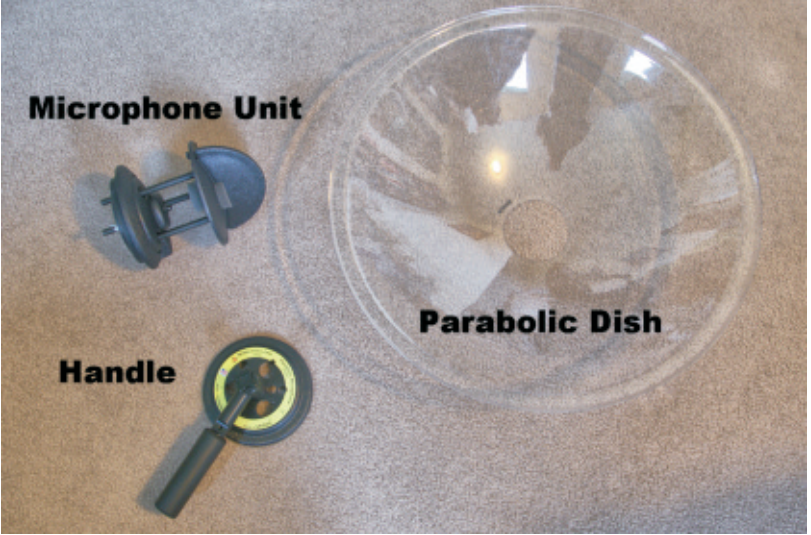
Major components of the Parabolic Microphone

Disassembly and assembly is easy. The Wildtronics Professional Parabolic Microphone is comprised of three major parts: the Parabolic Dish, the Handle, and the Microphone Unit.