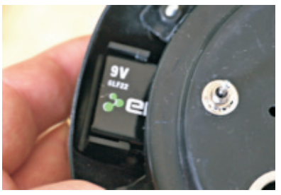
Seat battery into snap.