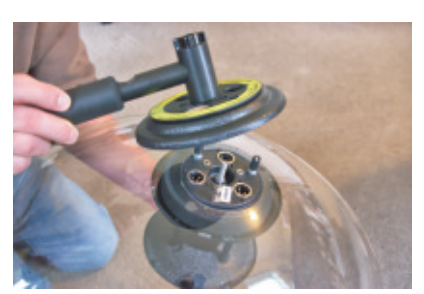
Center Handle onto stud.